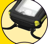
Neck Lanyard Kit