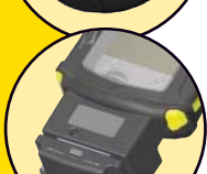
Magnetic Card Stripe Reader