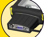
Tall GPS POD