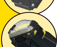
Vehicle Mount Kits

Other mount options available www.otterbox.com