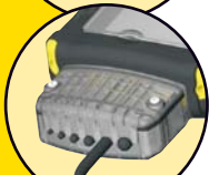
Cable Pass Through Kit